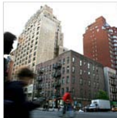
The City: Caught in the Subway's Headlights