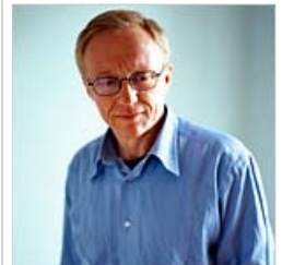
Escaping From Israel, Into My Fiction

Home | World | U.S. | N.Y. / Region | Business | Technology | Science | Health | Sports | Opinion | Arts | Style | Travel | Jobs | Real Estate | Automobiles | Back to Top