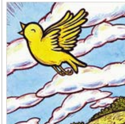
Special Section: Children's Books